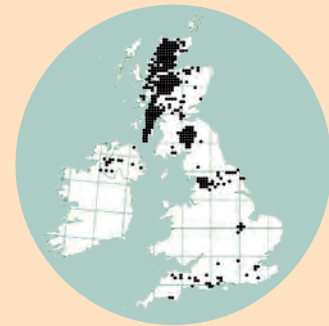
Distribution of Sika deer in the UK

Sika deer are rapidly increasing in the British countryside although their main strongholds are patchy. In Scotland, Sika deer ranges are expanding from west to east. They are also found in Northern Ireland.